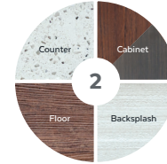
DARK TWO-TONE FINISH

The Yard features three distinct “zones,” each with its own vibe, including design and experience nuances.