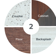
DARK TWO-TONE FINISH

The Yard features three distinct “zones,” each with its own vibe, including design and experience nuances.